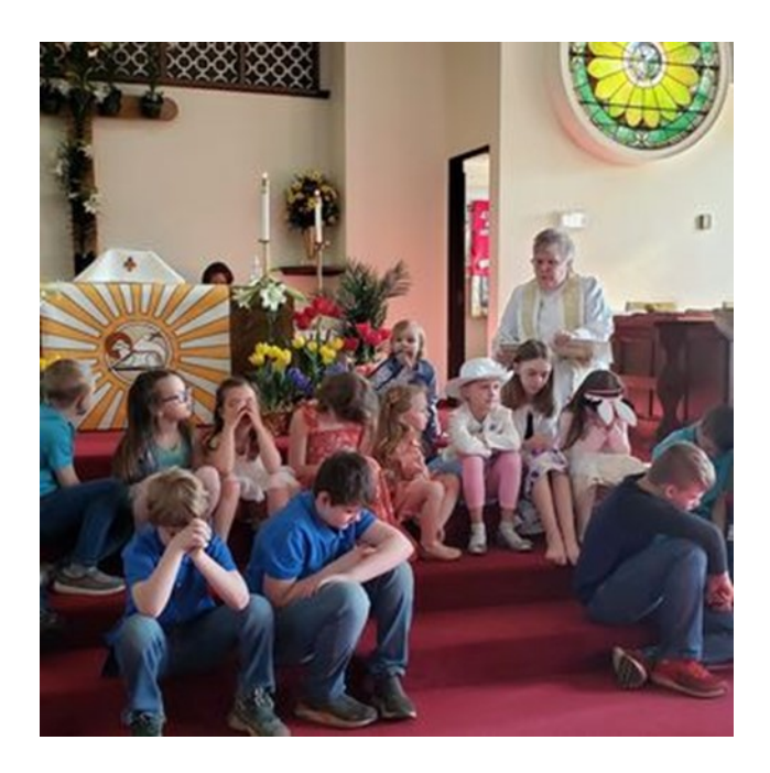
Bowed heads in prayer