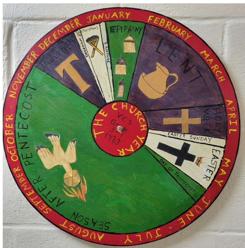
From the halls of Faith - The Church Calendar - Grades 3 & 4, 1983